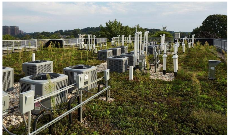
The Green Roof at 22 Tarrytown