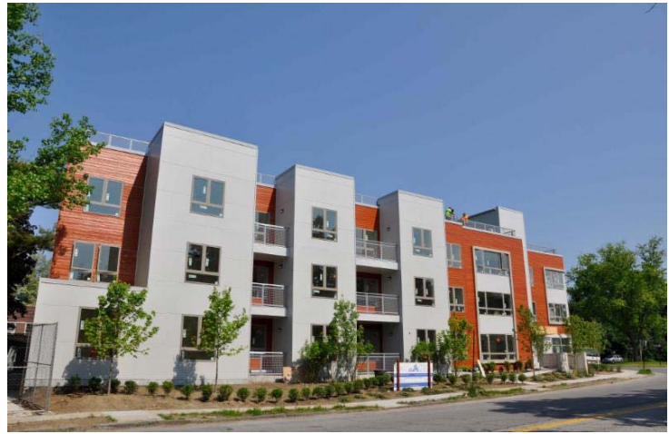
Front of 22 Tarrytown (above)

Improving housing for the formerly homeless